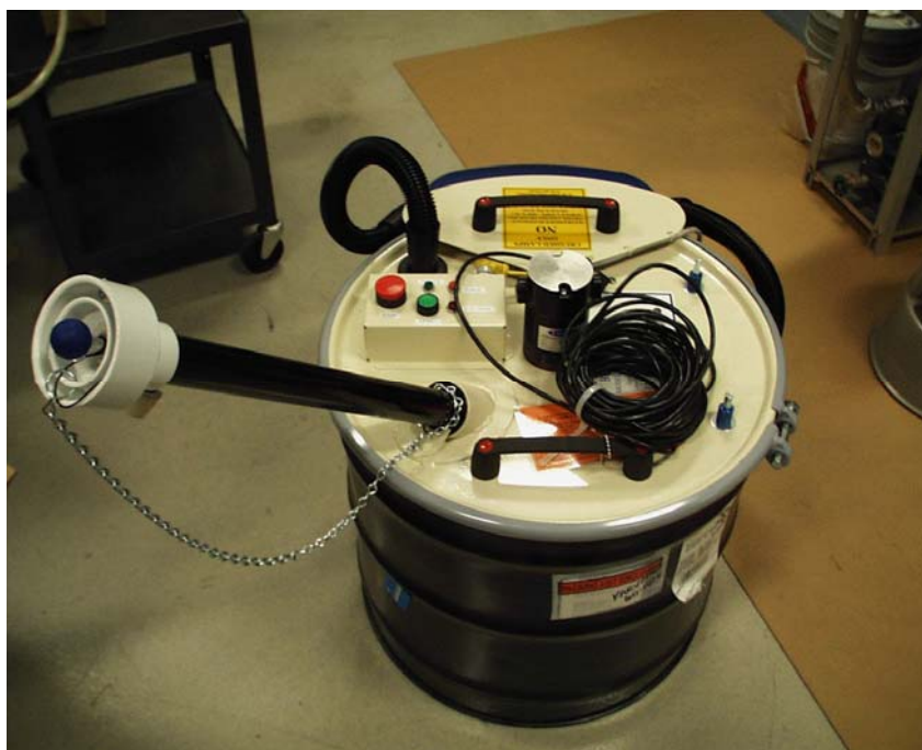
Figure 1. The Bulb Eater™ Model 55-VRS

Air Cycle Corporation made many mechanical integrity improvements during the latter half of 2002 to eliminate mercury emissions at potential leakage points (e.g. connections, fittings, attachments, etc.) as a result of mercury emission concerns by the U.S. Navy. Also newly developed for the system is the addition of a 10" storage drum for attaching the unit when not in use. The storage drum prevents phosphor and mercury particulate residue on the chain side of the unit from contaminating the storage area when not in use and when not mounted atop a 55-gallon waste drum. The 10" storage drum also saves space when the unit is stored. Air Cycle Corporation also improved the system further by including an air purge cycle that will run the vacuum pump for 7 to 10 seconds after the machine is turned off, a drum open sensor that cuts off the motor if the drum lid is opened, and a new control panel complete with indicator lights. The result of these efforts is the Bulb Eater™ Model VRS system. Figure 1 displays the Bulb Eater™ Model VRS system atop a 55-gallon crushed lamp waste drum.